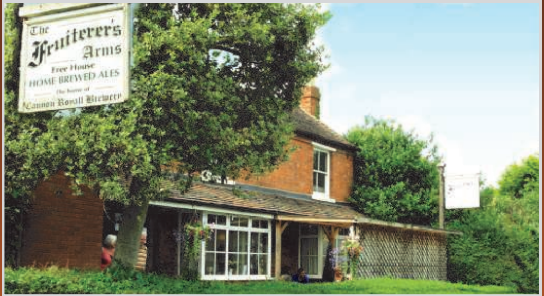
Fruiterer's Arms, Uphampton